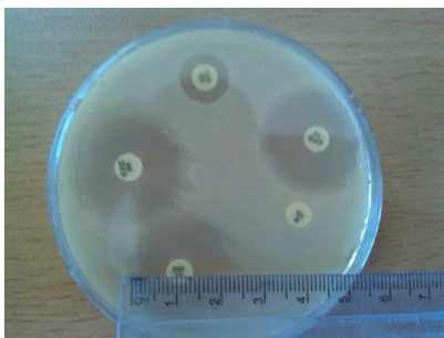
Figure 1. The result of disc diffusion

All strains of K. pneumoniae were analyzed after definitive isolation and diagnosis for disk diffusion test. The diameter of the inhibition zone around the discs was measured using a millimeter ruler and was evaluated in accordance with the CLSI 2017 standard table. The