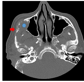
Figure 1. Axial pre-treatment paranasal sinus CT scan without contrast at zygomatic arch level. The red arrow shows an osteolytic metastatic lesion in the right zygomatic arch and the blue circle shows a metastatic mass lesion in the right maxillary sinus with osteolytic involvement of the posterolateral wall.

Bone, lung, liver, and brain are the most common sites for the emergence of breast cancer metastasis (8). The involvement of paranasal sinuses in breast cancer is infrequent and breast cancer metastasis to paranasal sinuses has been reported in less than 20 patients (9). The most usual site of breast cancer metastasis to paranasal sinuses is maxillary sinus and maxillary antrum (2,6), followed by ethmoid, frontal, and sphenoid sinuses, respectively. Metastasis can occur via hematogenous or lymphatic vessels. It seems that the most likely routes for breast metastasis to paranasal sinuses are hematogenous via vena-cava, pulmonary circulation, and arterial