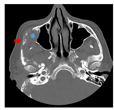
Figure 1. Axial pre-treatment paranasal sinus CT scan without contrast at zygomatic arch level. The red arrow shows an osteolytic metastatic lesion in the right zygomatic arch and the blue circle shows a metastatic mass lesion in the right maxillary sinus with osteolytic involvement of the posterolateral wall.

Bone, lung, liver, and brain are the most common sites for the emergence of breast cancer metastasis (8). The involvement of paranasal sinuses in breast cancer is infrequent and breast cancer metastasis to paranasal sinuses has been reported in less than 20 patients (9). The most usual site of breast cancer metastasis to paranasal sinuses is maxillary sinus and maxillary antrum (2,6), followed by ethmoid, frontal, and sphenoid sinuses, respectively. Metastasis can occur via hematogenous or lymphatic vessels. It seems that the most likely routes for breast metastasis to paranasal sinuses are hematogenous via vena-cava, pulmonary circulation, and arterial